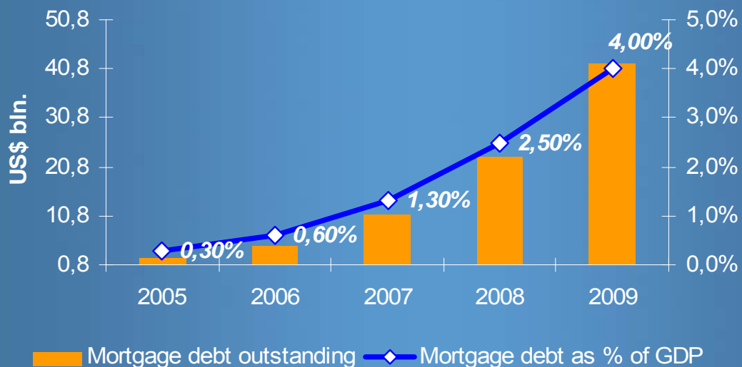
Mortgage Market forecast